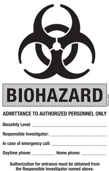
Figure 1. Biohazard warning sign for laboratory doors

However, even though biosafety and laboratory biosecurity are in most respects compatible, a number of potential conflicts exist that need to be resolved.